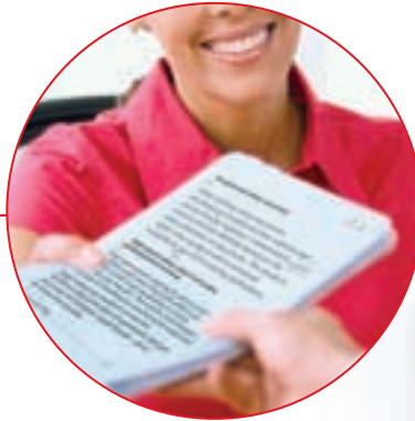
Scan light text and even pencil marks perfectly

An extensive range of image processing functions enhance ease and efficiency. When you're scanning from documents that have been kept in a binder, it usually leaves unsightly marks. The DR-1210C has a 'remove punch holes' function which automatically blanks out these black dots, so you always get clean and clear scans. Other practical functions include auto page size detection, skew correction, border erasure, text orientation recognition, edge emphasis and pre-set gamma curve.