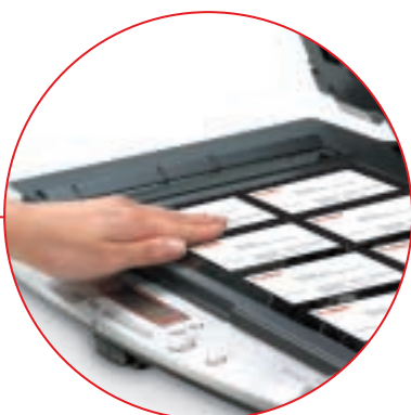
Scan up to 8 business cards in a single run