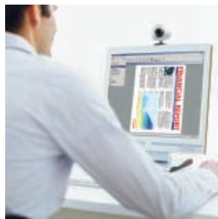
Enjoy Capture Perfect ease